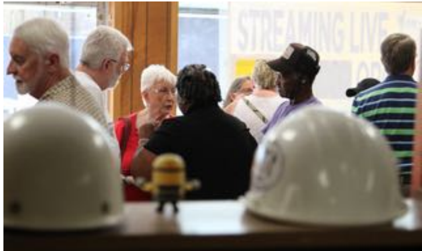
Guests enjoy conversation at the Hard Hat Preview Party at WHCP.